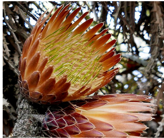
King Dryandra August/ September

The one kilometre Breakaway Trail (Grade 3, 45 minutes) leads to the western side of the mesa, and winds through ironstone pavement around the edge of the breakaway, before a moderately steep descent into a cool shady gully in rock sheoak/wandoo woodland, with abundant winter ferns, rushes, cowslip orchids and everlastings. The track goes past the old dam, follows an old fenceline, and across a rock where you may find Lemon Scented Sun Orchids. The loop then heads back to the picnic site