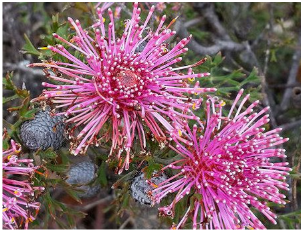
Isopogon crithmifolius September, October

The dense ironstone soil here has similar sparse proteaceae vegetation including the stunning spring-flowering pink Isopogon crithmifolius , and the secretive king dryandra ( Banksia proteoides ) that hides flowers inside the bush. Keep your eyes and ears open for bird life.