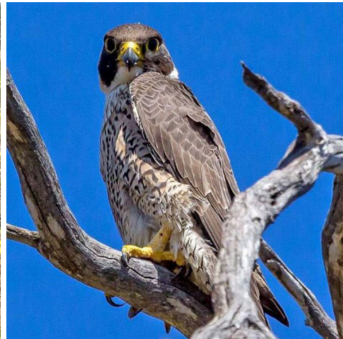
Peregrine falcon