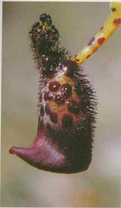
Above The warty hammer orchid's labellum (modified petal or lip) resembles a female wasp.