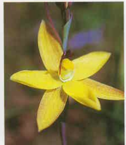
Below Lemon-scented sun orchid.