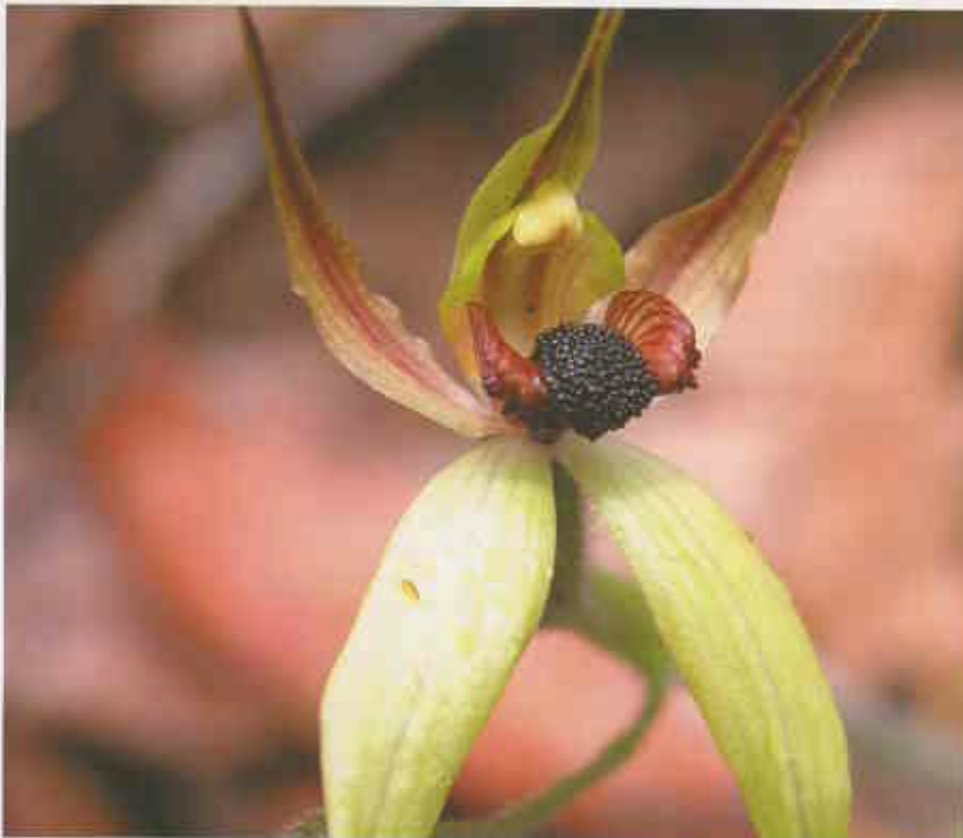
Left Leaping spider orchid, another species with a striking female decoy.

Other species of Caladenia have larger, darker, more clumped and more conspicuous calli than those of the common spider orchid and white spider orchid. As a result, the labellum of the zebra orchid ( C. zeyheriana ), bee orchid ( C. discoides ), leaping spider orchid ( C. macrostylis ) and others are ornamented with structures obviously similar to those exhibited by hammer orchids. In