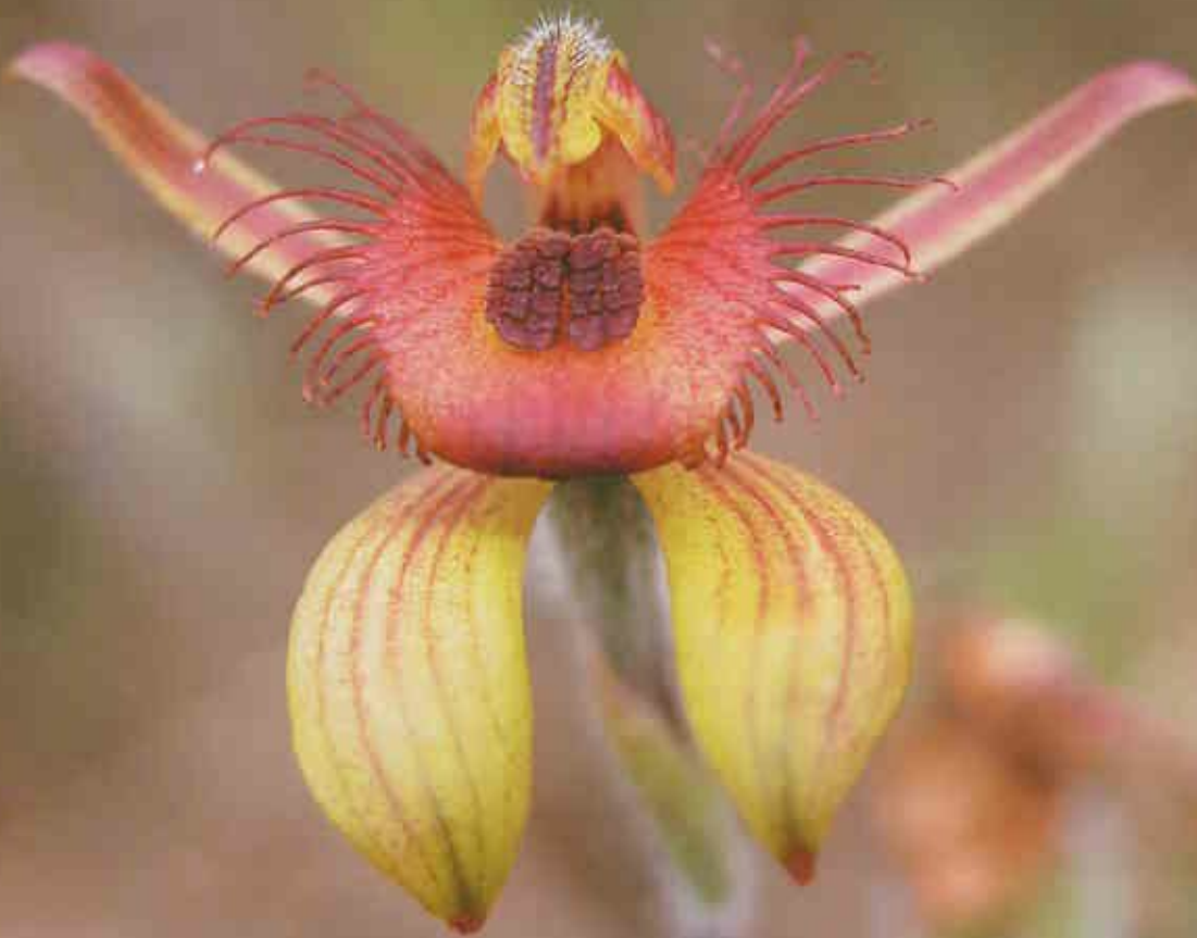
Above Bee orchid. Note how the aggregated calli (glands) produce a female decoy.