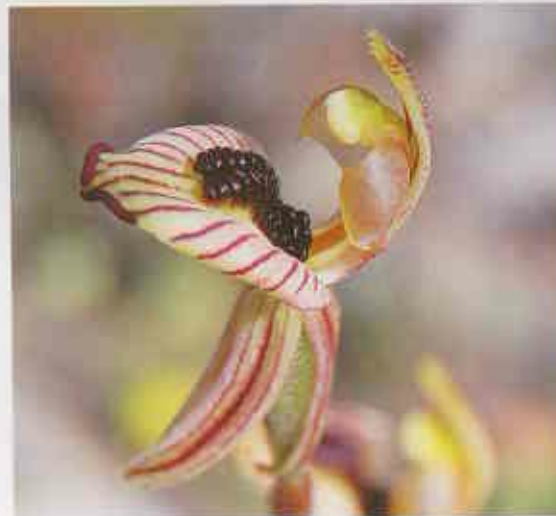
Top left Common spider orchid, a species with small pale calli (glands) on the labellum (lip).

Other spider orchids have calli that are only slightly larger and barely more conspicuous than those of the common spider orchid. The magnificent white spider orchid ( C. longicauda ), with up to eight rows of pale purplish calli lined up on the labellum, is representative of this group. Although most populations of this species are pollinated by bees, members of one group found north of Esperance use sexual deception to attract males of a wasp species. It is likely that a small alteration in the scent produced by glands on the petals and sepals of plants in this population (now known as C. longicauda subsp. rigidula ) happened to lure a few male wasps, which proved to be excellent pollinators. The odour, combined with the visual stimuli provided by the lip petal, worked well enough so that, over time, plants producing the wasp-attracting odour became the dominant form in this and other populations. This example demonstrates that even highly-