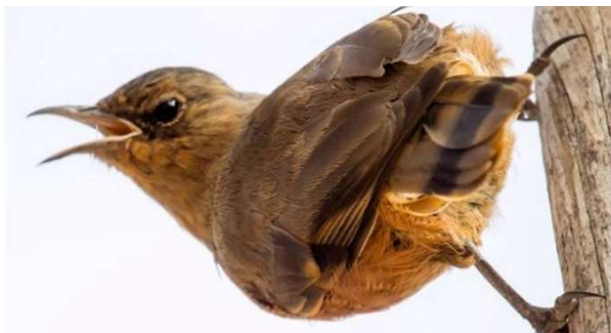
Rufous tree creeper

Listen for their distinctive “spink” call.