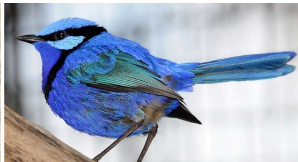
Splendid wren male